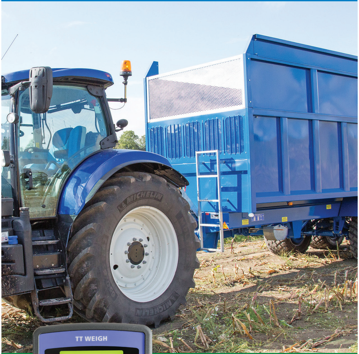
A trailer weighing system for hydraulic tipping trailers.