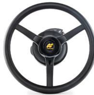
Guidance Manual and Auto-steering Solutions