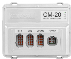
Apollo Seeding/ Planting Controller Seeding and Planting Implement Control