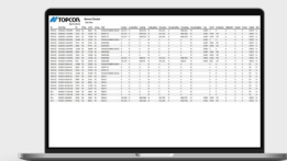
Harvest Tracker PC Software